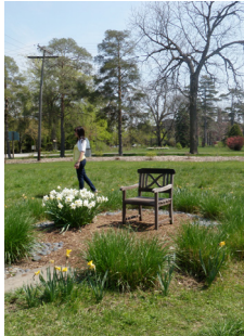
Walking the Labyrinth

Come and spend time “being” creative and nurturing your body, mind and soul in a sacred, safe and peaceful environment. You do not